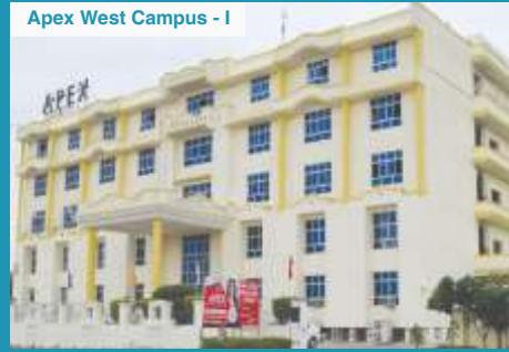
Apex West Campus - I