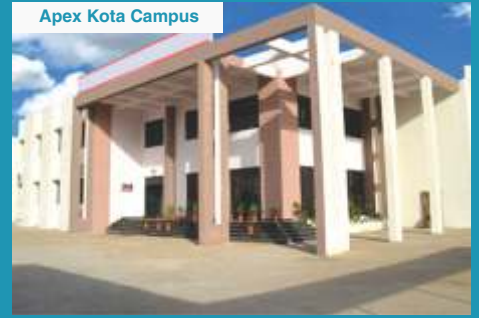
Apex Kota Campus