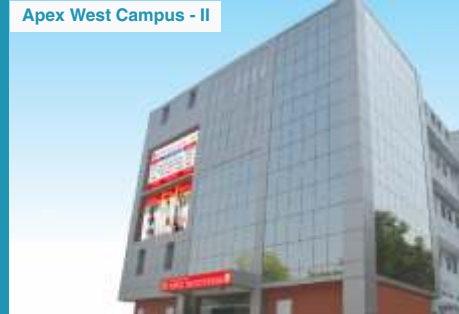
Apex West Campus - II