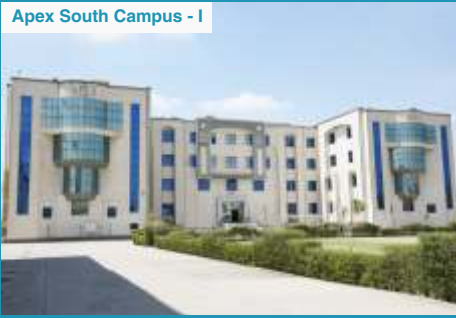
Apex South Campus - I