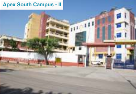
Apex South Campus - II